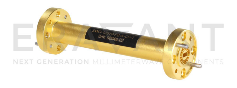
STQ Contactless Flange Front View