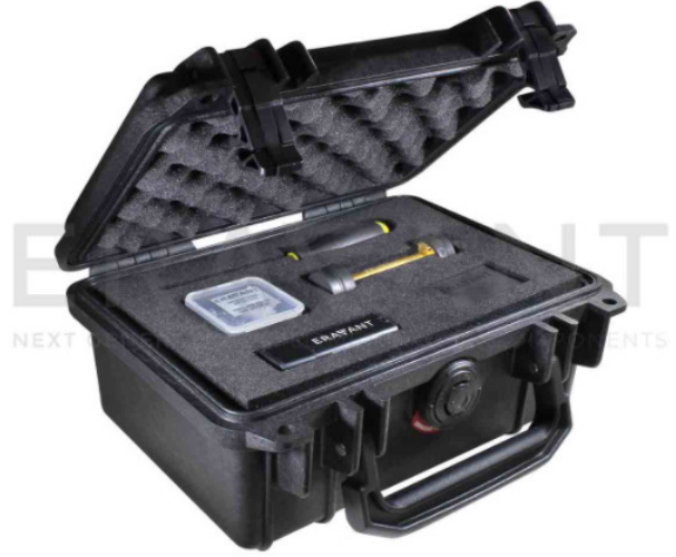
STQ Case Inside View