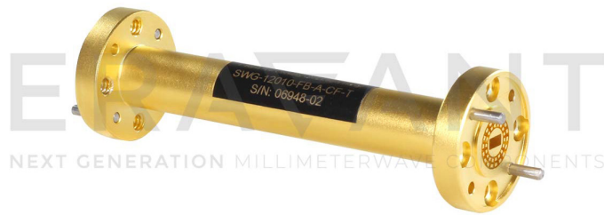
STQ Contactless Flange Front View