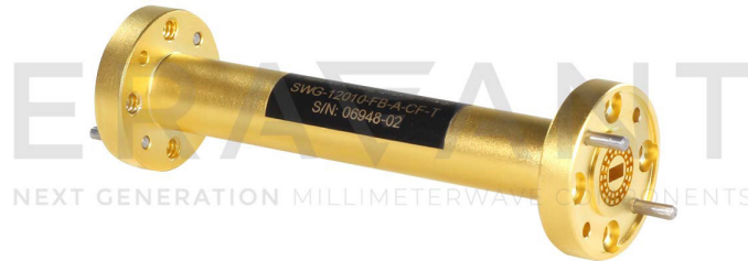
STQ Contactless Flange Front View