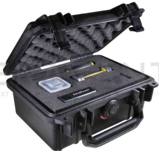
STQ Case Inside View