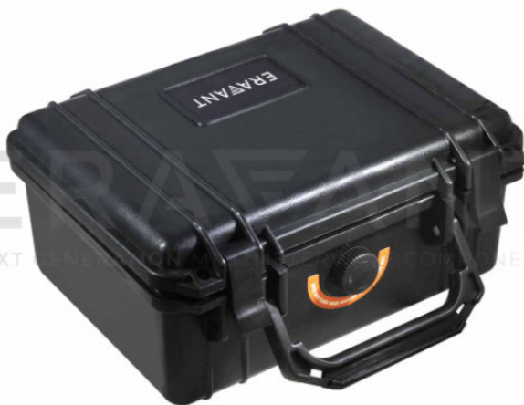
STQ Case Outside View