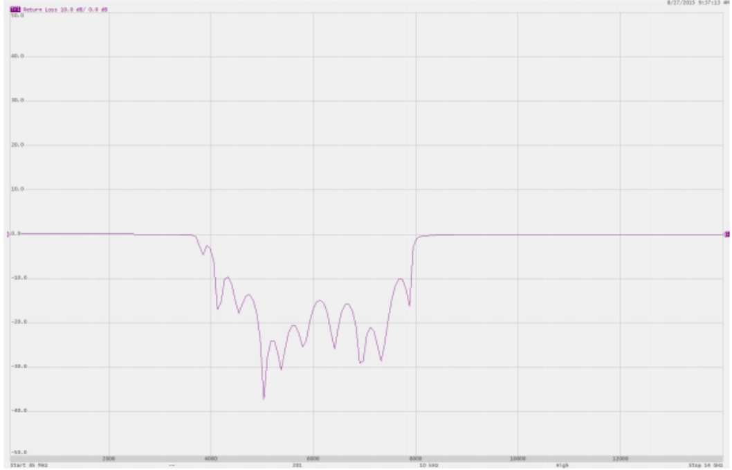
Figure 1: Magnitude vs frequency

In this description, 85 MHz was chosen arbitrarily; the response of the DUT can be measured at any frequency within the VNA's frequency range. In fact, normally the VNA will be configured to test a number of different frequencies in this same manner. S_{11} will have some number of Points then, starting at the lowest frequency we test (a Start Frequency), and ending at the highest (a Stop Frequency). We can now plot the magnitude of S_{11} versus frequency, or the phase of S_{11} versus frequency. Here is an example of how the magnitude and phase plots may appear.